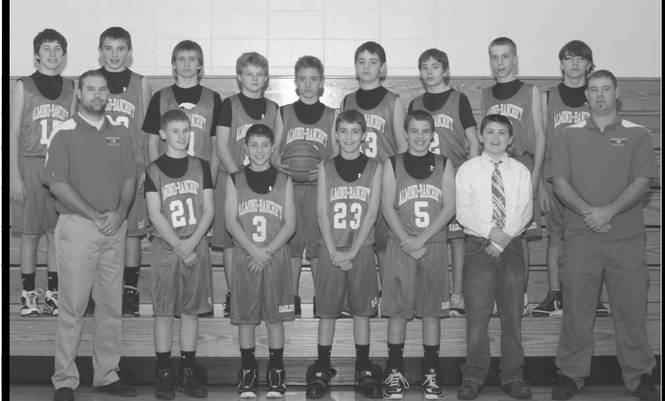
2009 Middle School Basketball Team

ALMOND-BANCROFT EAGLES 7TH-8TH GRADE BASKETBALL 2009